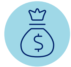
PEER-SELECTED GRANT CAPITAL